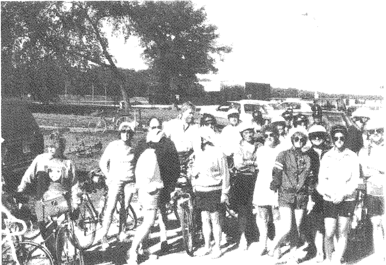
The Start of a Novice Ride